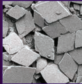
Wax crystals in a untreated Diesel fuel

Diesel Plus contains Cold Flow Improvers that alter the Diesel Fuels ability to form wax crystals. This allows for a lower CFPP (cold filter plugging point) to be obtained.