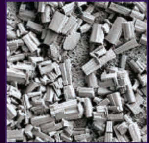
Wax crystals in Diesel fuel treated with Diesel Plus