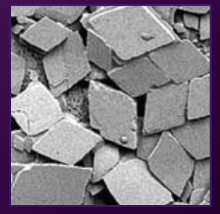
Wax crystals in a untreated Diesel fuel

Diesel Plus contains Cold Flow Improvers that alter the Diesel Fuels ability to form wax crystals. This allows for a lower CFPP (cold filter plugging point) to be obtained.