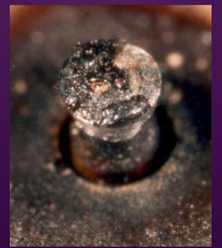
Injector pintle - a fuel system conditioner has not been used

Per topteirgas.com, "Since the minimum additive performance standards were first established by EPA in 1995, most gasoline marketers have actually reduced the concentration level of detergent additive in their gasoline by up to 50%. As a result, the ability of a vehicle to maintain stringent Tier 2 emission standards has been hampered, leading to engine deposits which can have a big impact on in-use emissions and driver satisfaction."