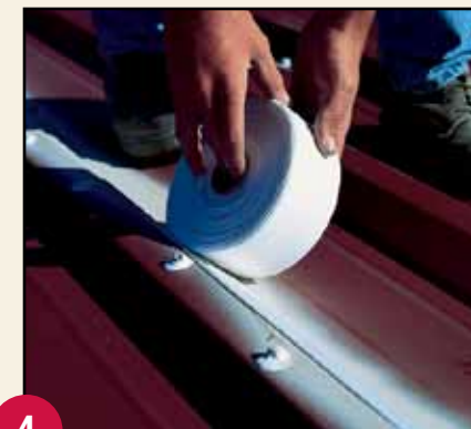
4 Reinforce existing seams with Spunflex® or Butyl Tape and base coat.