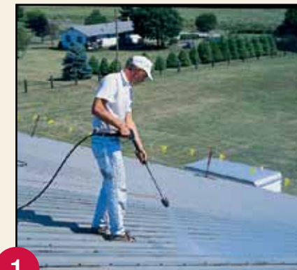
1 Power wash and clean with Rust Off®.

Conklin's MR Systems offer additional benefits beyond stopping leaks and inhibiting rust. Conklin highly-reflective roof coatings reduce the destructive thermal shock experienced by metal roofs during extreme fluctuations in temperature. This minimizes the amount of expansion and contraction experienced by the roof and greatly increases its useable life.