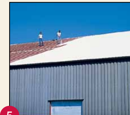
5 Seal entire roof with one of our approved acrylic coatings: • Rapid Roof® HV • Bench Mark® • Rapid Roof III® • PUMA® XL • Equinox®