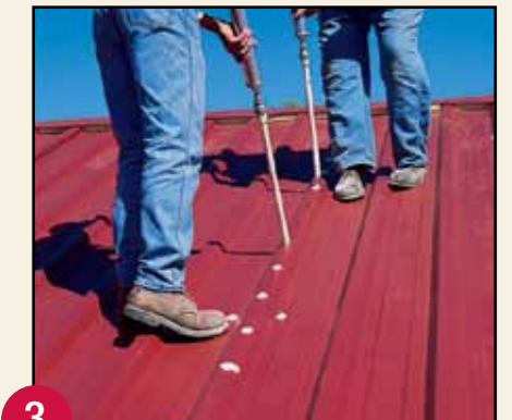
3 Kwik Kaulk® all fastener heads.