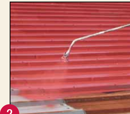
2 Prime with Metal Ready® Universal.