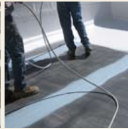
4. Seal entire roof with Rapid Roof® III or Equinox Top Coat.

*See Product Specifications for current pull-test requirements.