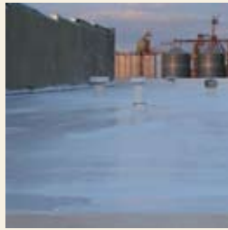
2. Prime surface with Tack Coat Single-Ply membrane primer.