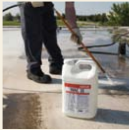
1. Power wash and clean with Wac II Roof Cleaner