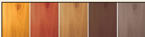
Natural Redwood Light Brown Dark Brown Gray